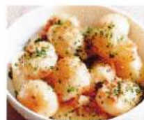
Oven Roasted Little Potatoes