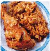
Authentic Puerto Rican Chicken & Rice